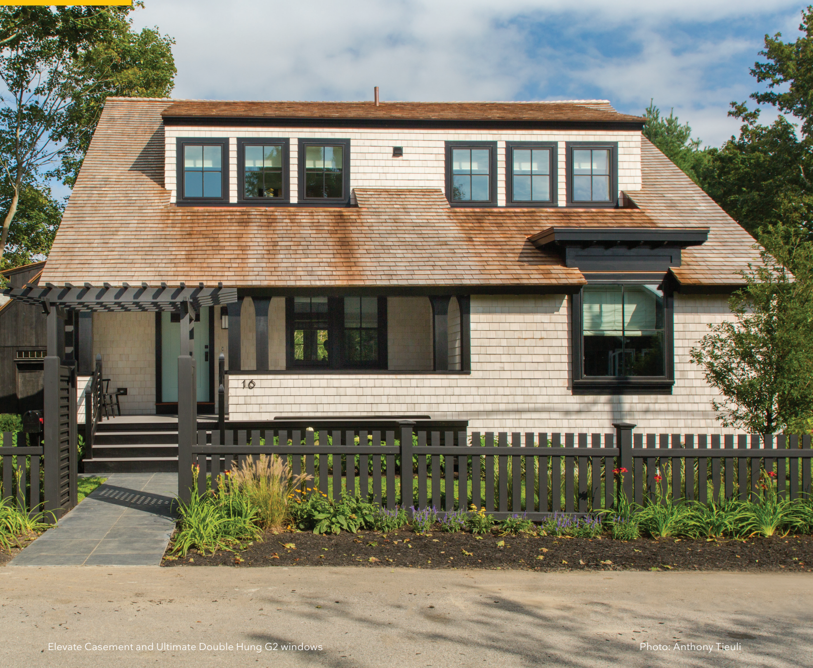
Elevate Casement and Ultimate Double Hung G2 windows