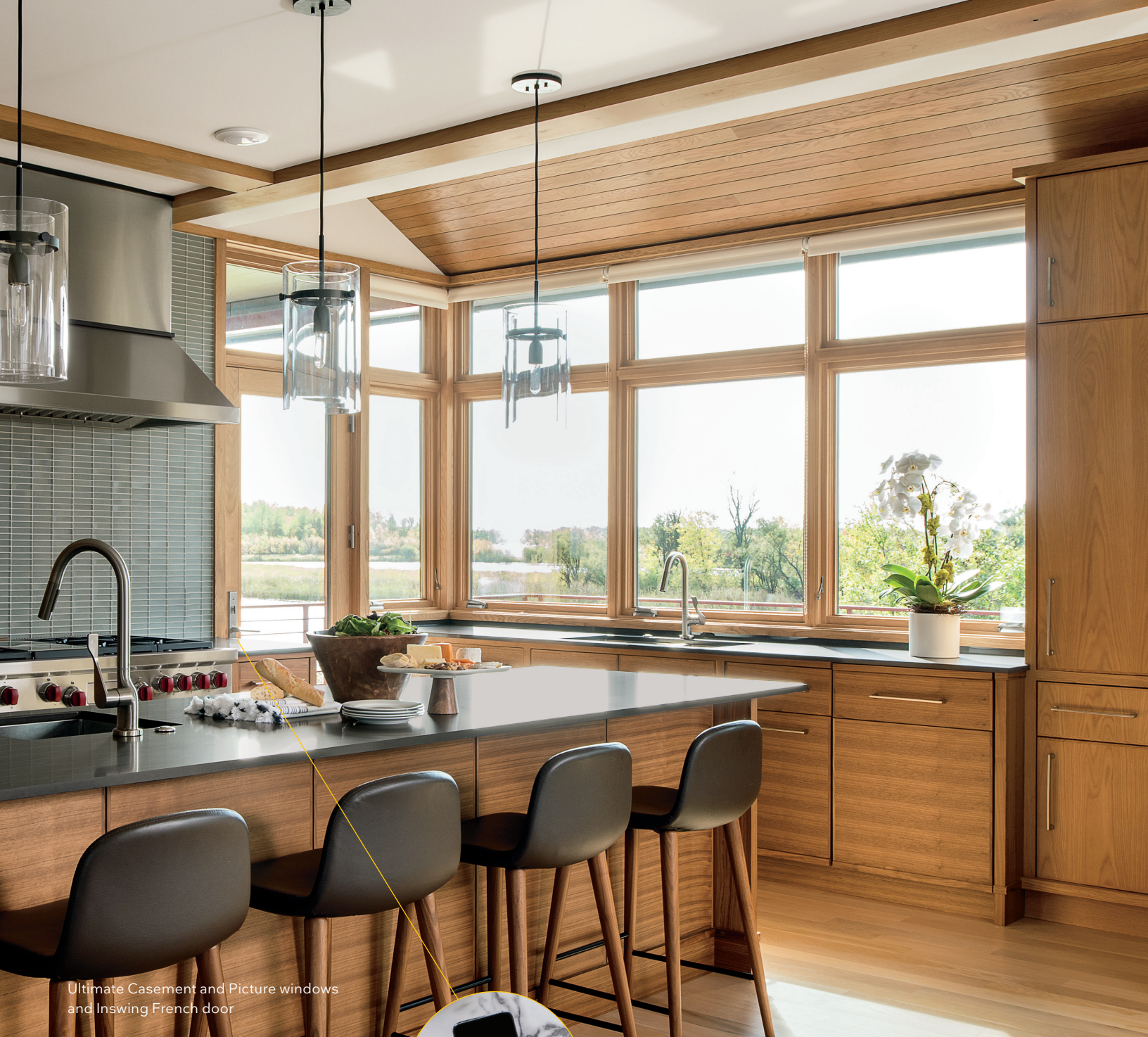
Ultimate Casement and Picture windows and Inswing French door