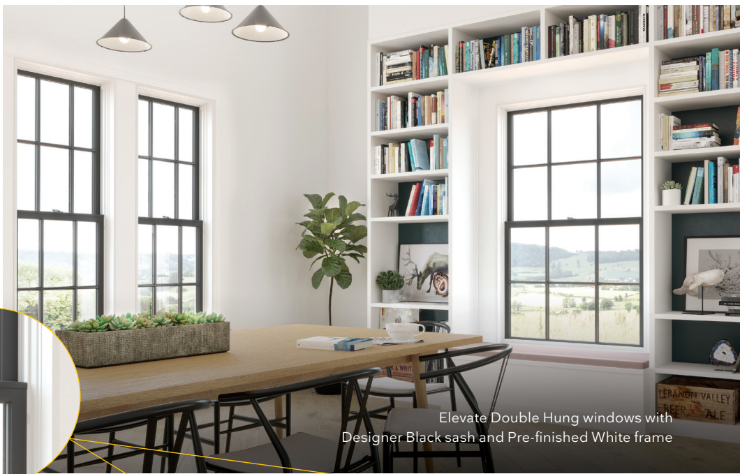
Elevate Double Hung windows with Designer Black sash and Pre-finished White frame