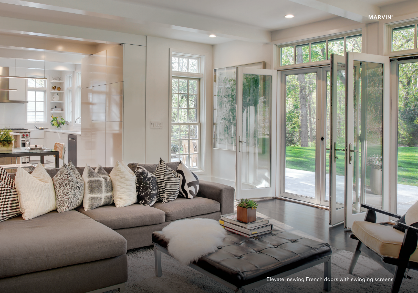
Elevate Inswing French doors with swinging screens