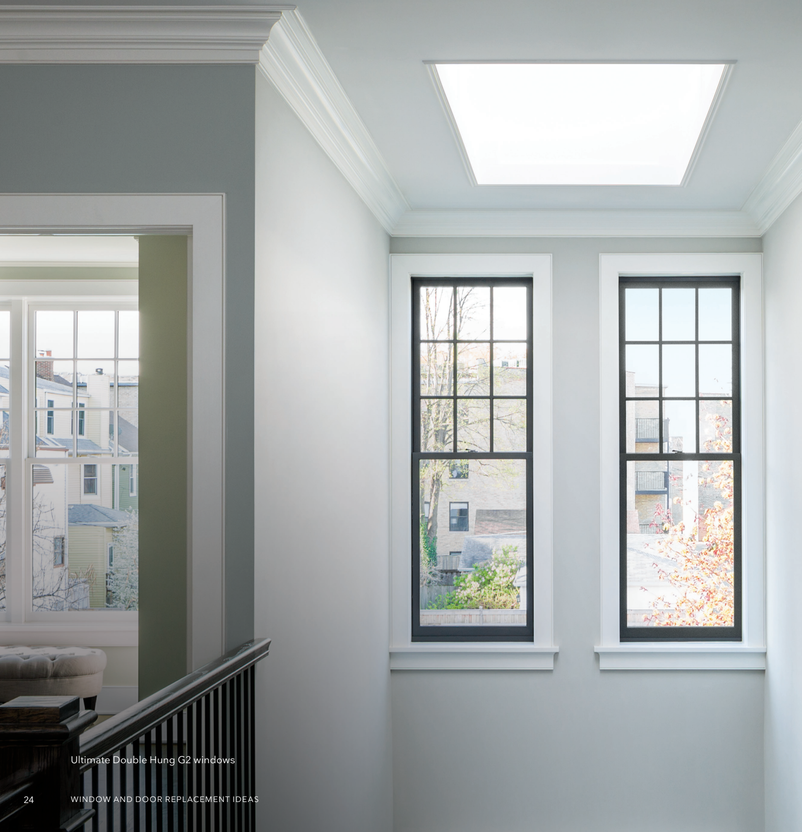
Ultimate Double Hung G2 windows