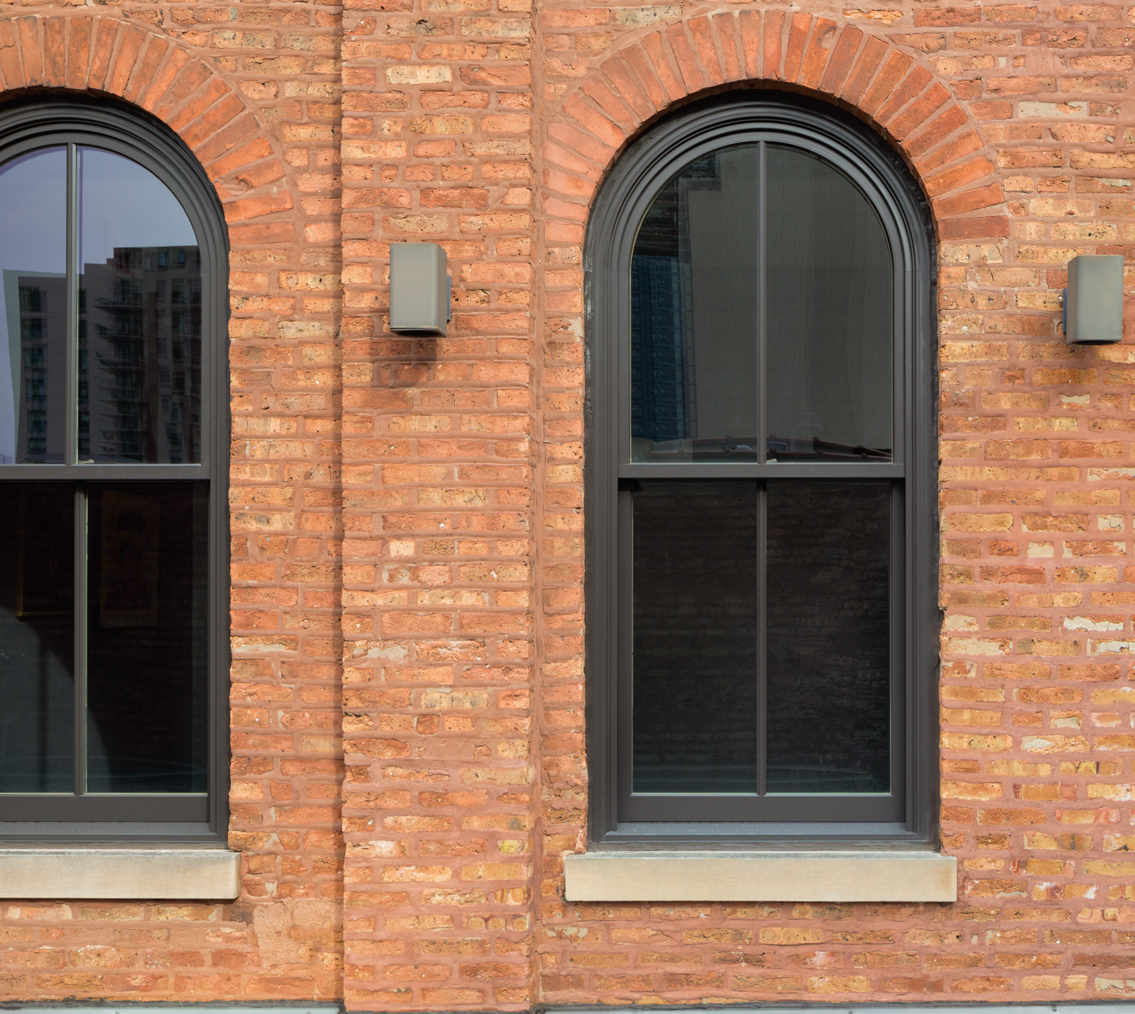
Ultimate Double Hung G2 Round Top windows