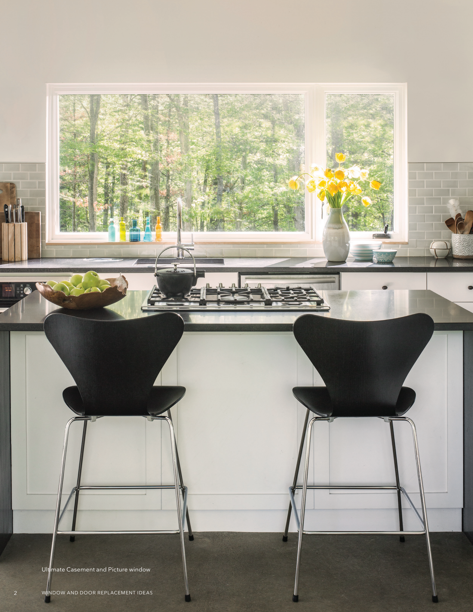
Ultimate Casement and Picture window