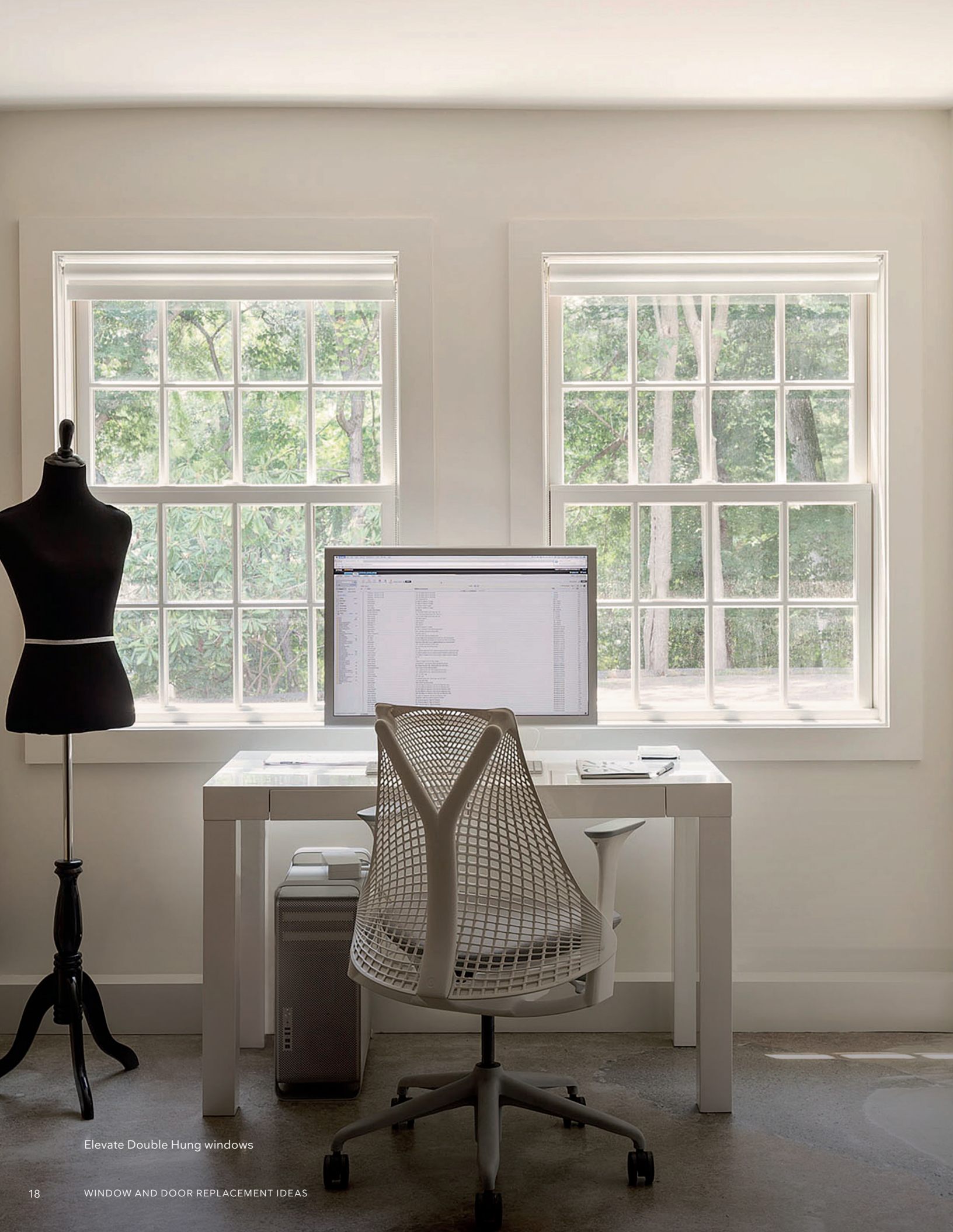
Elevate Double Hung windows