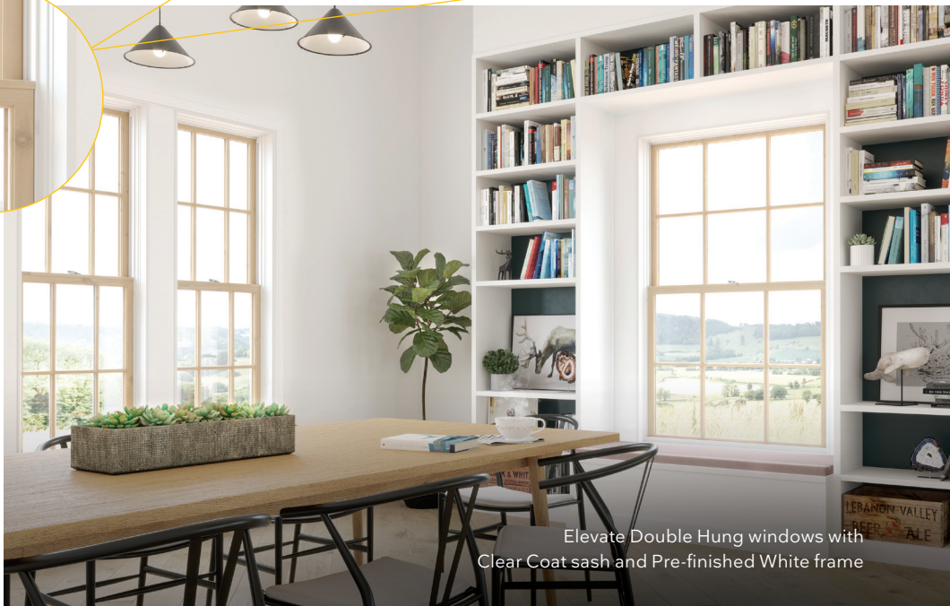
Elevate Double Hung windows with Clear Coat sash and Pre-finished White frame