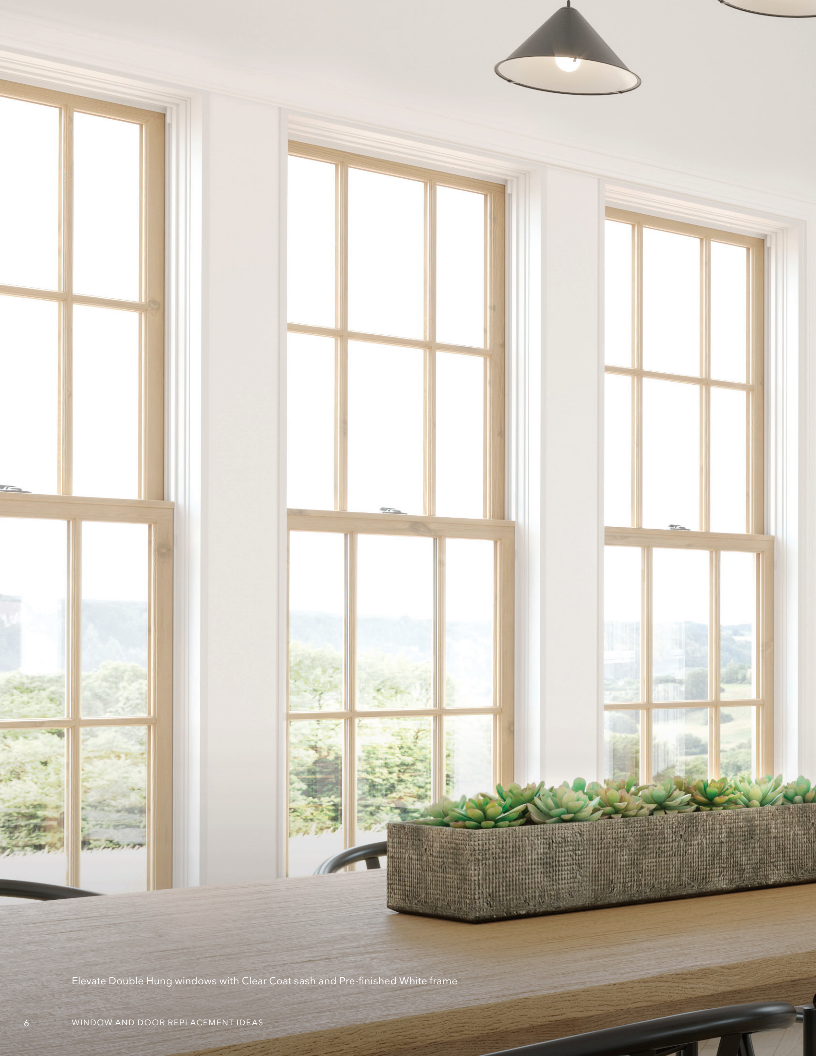
Elevate Double Hung windows with Clear Coat sash and Pre-finished White frame