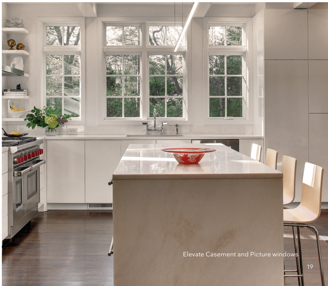
Elevate Casement and Picture windows

Choosing a white interior color for your windows helps accentuate the natural light from outside.